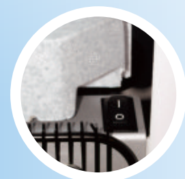
Hot tank power switch